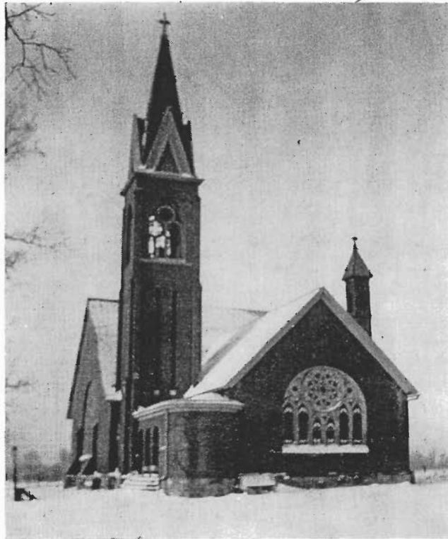
Second Building of Mt. Zion (Hay's) Reformed Church erected in 1898