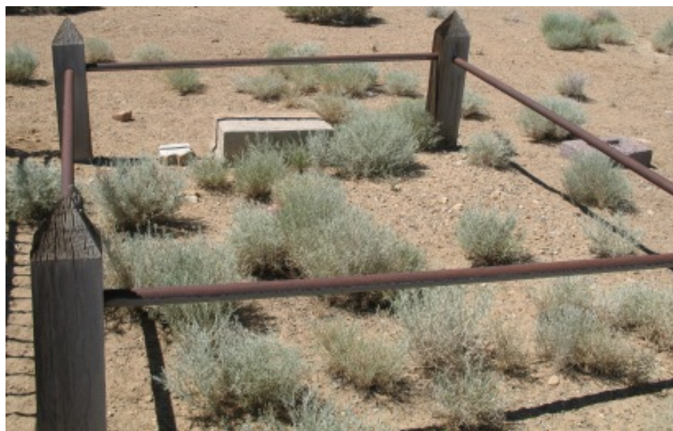
Isbell Family Plot