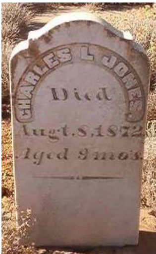
Date of death on stone is 8 Aug 1872.