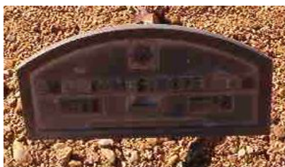
Photo is blurry.