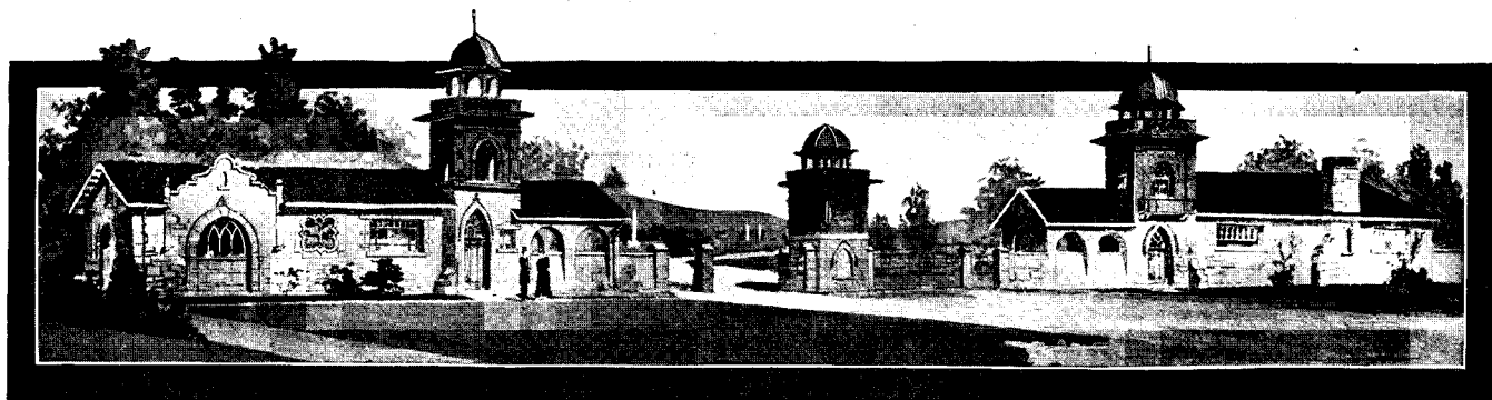
ENTRANCE, SANTA MONICA BOULEVARD